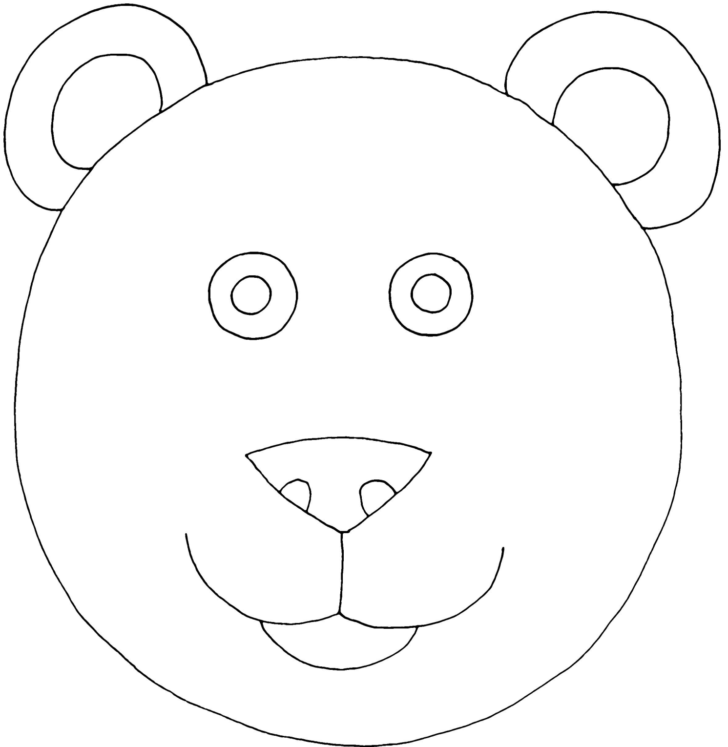
bear face template